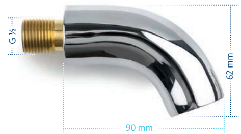
Profilence Fix 162xx