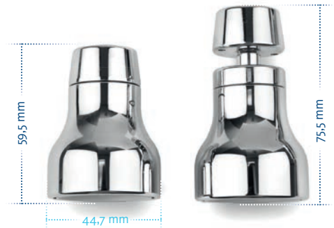
Profilence VP 161xx