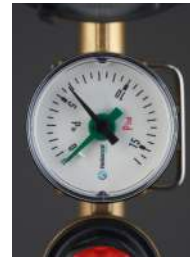
GAGE201001 Dual Reading Gauge