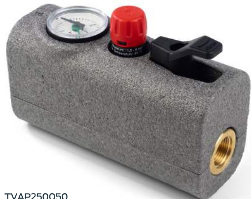
TVAP250050 with insulation cover