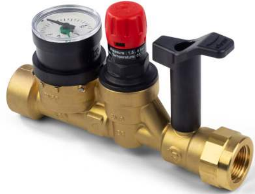
TVAP250050 without insulation cover

WRAS approved for hot and cold water, the valve is suitable for pressures up to 16 bar and temperatures up to 65°C. It is also adjustable between 1.5 - 6.0 bar.